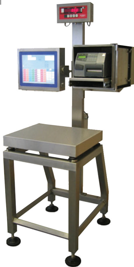
Our OCM and Frame

If you invest in our Stock & Despatch system, the OCM can automatically book your products into stock - ready to be despatched. When used in combination with our Planning & Availability module, Integreater's OCM is also capable of linking to a prepared plan.